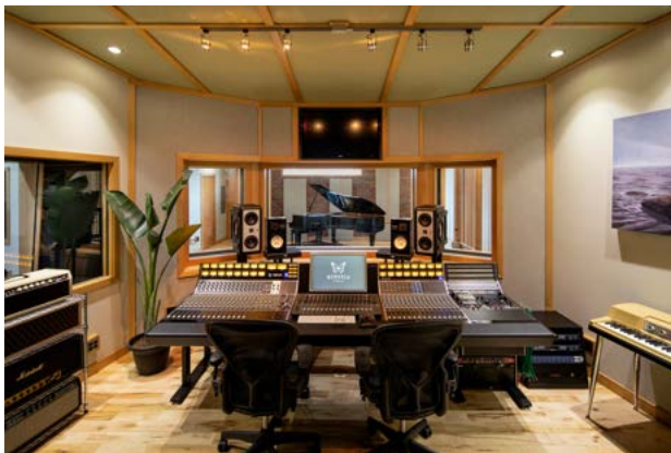
Monarch Studios Control Room