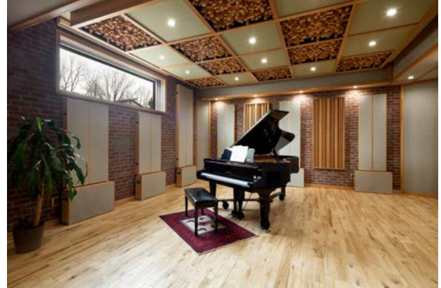
Monarch Studios Live Room - view looking towards the window