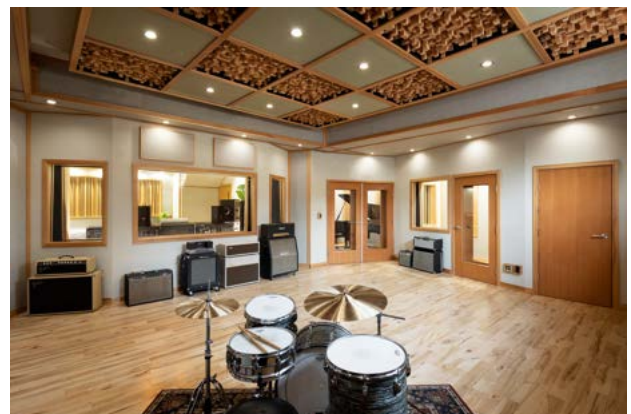
Monarch Studios Live Room - view from behind the drum kit