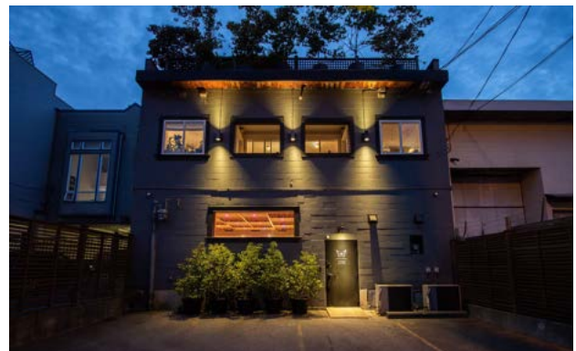
Back of Building

There is convenient load-in at the back of the building and also 3 parking stalls you are welcome to use, accessed from the alley. Look for another black door with a white butterfly and 3702 on it, and press the CALL button when you arrive.