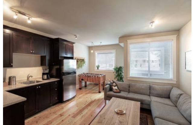
Monarch Studios Lounge

Coffee, tea, water, and some light snacks are provided in our private lounge. We recommend bringing some other healthy snacks to your session as well to keep everyone's energy up. Nearby restaurants within 1-block of the studio include Commercial Street Café, Chance Café, and The Flourist.